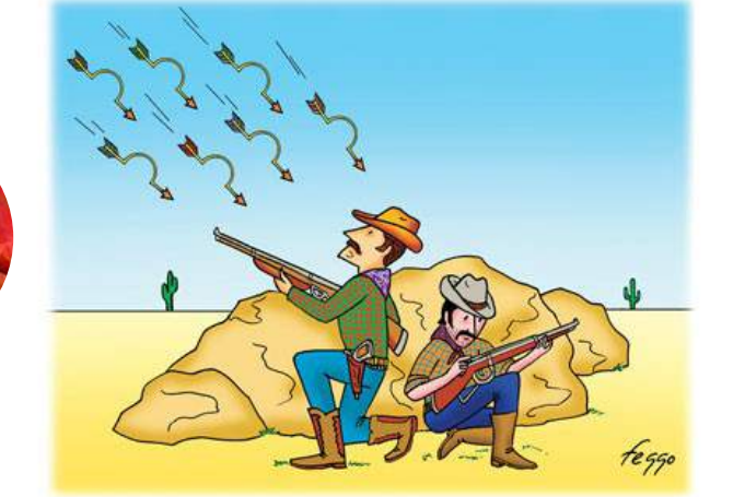
"We're under attack, but it doesn't seem serious."